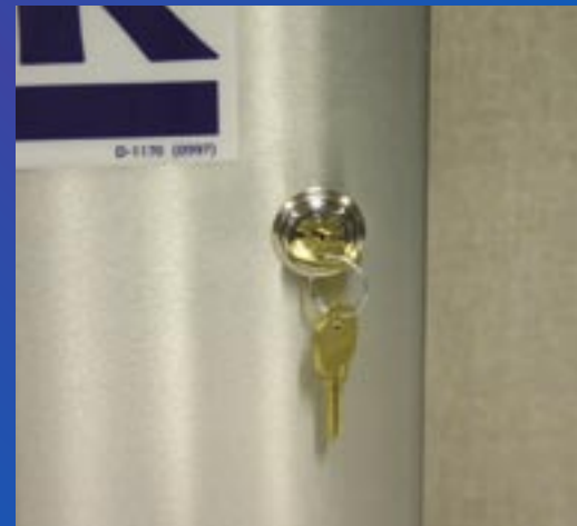
Concentration and system are locked.