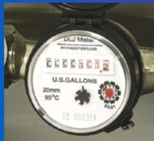
Pay for only the chemical you use, eliminating waste!